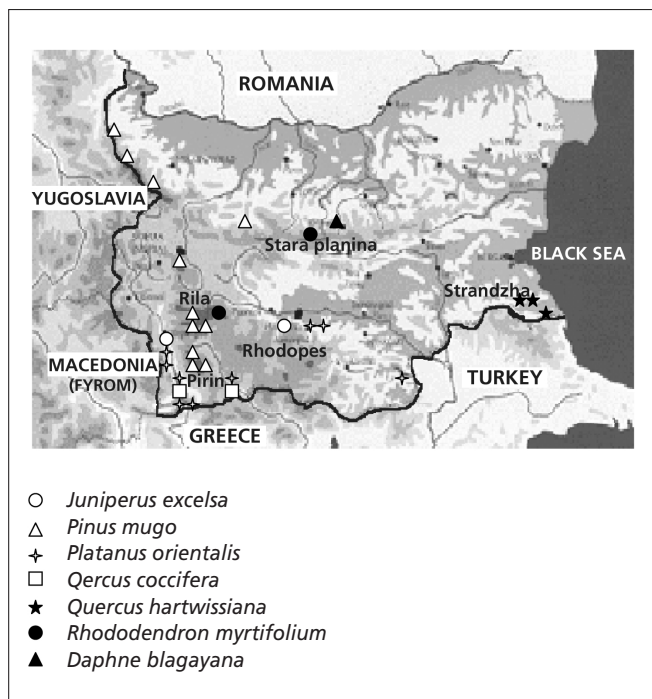
Figure 2: Natural distribution of some rare species in Bulgaria. Abbildung 2: Natürliche Verbreitung einiger seltener Spezies in Bulgarien.

Special attention should be given to two endemic pines: Pinus peuce Griseb., a Balkan endemic, and Pinus heldreichii Christ. (syn. P. leucodermis Ant.), called Balkan sub-endemic, occurring also in several isolated stands in Southern Italy (MORGANTE & VENDRAMIN, 1991). Both species grow in high